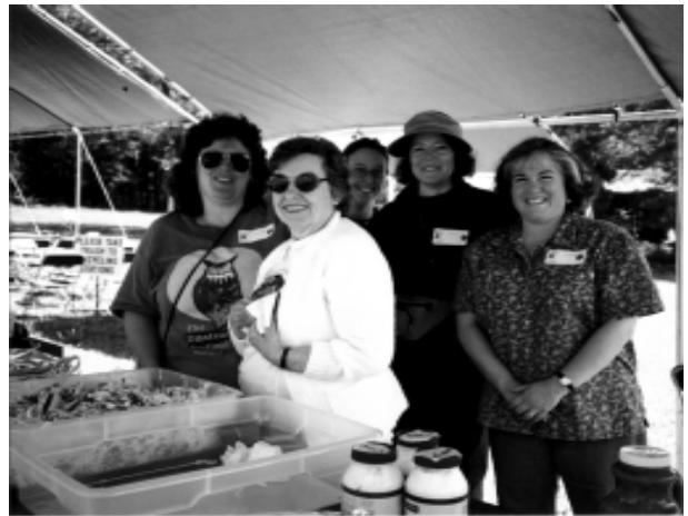
2000 Celebration for Umstead. Dedicated food servers.