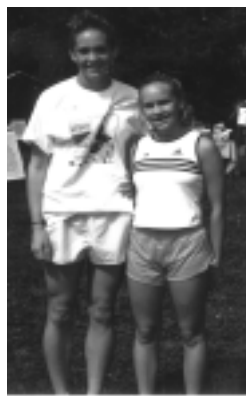
First female runners