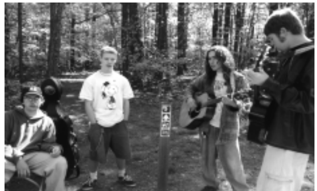
Shadows of the Rain - music on the walk/fun run trail.