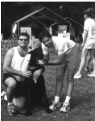
First and second male runners and first dog

Funds raised will be used to support environmental education and land acquisition for Umstead State Park.